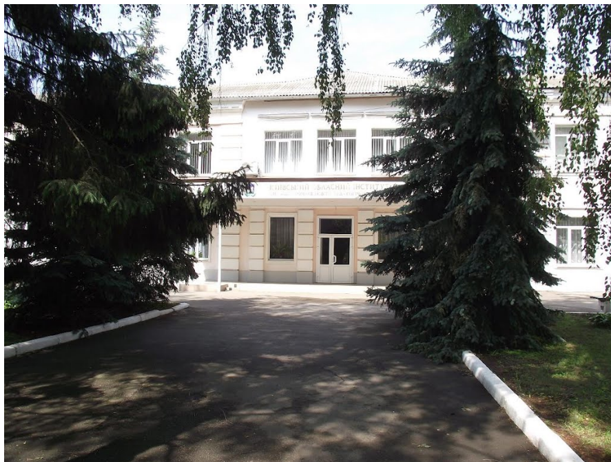
Main building of «Academy of In-Service Education»