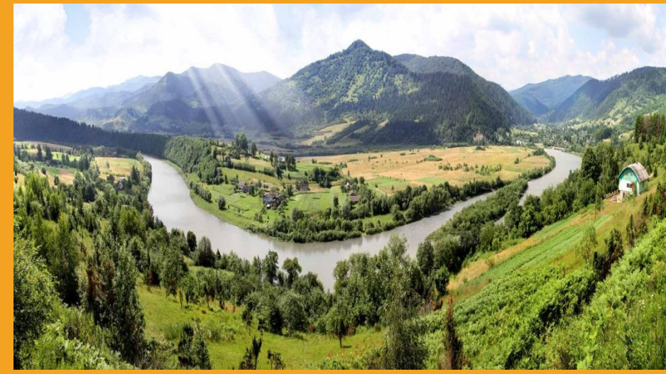
The wonderful nature of the Carpathian Mountains