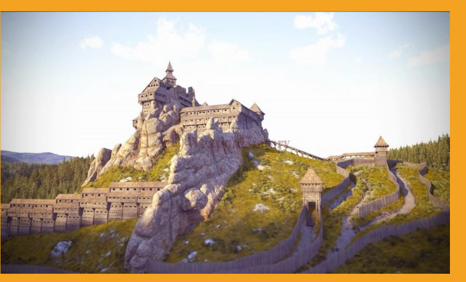
Rocky fortress city