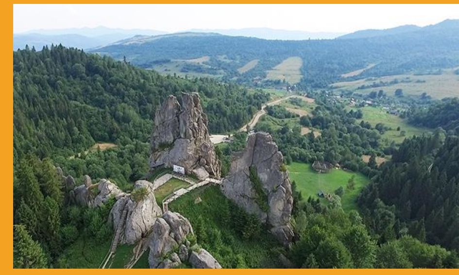
Historical and Cultural Reserve