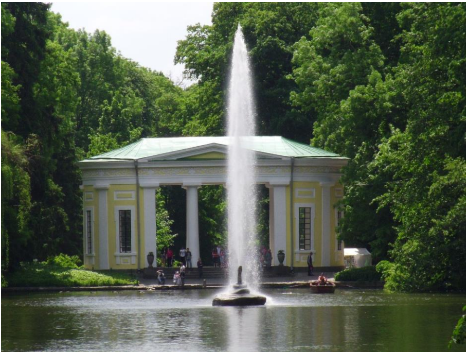
Sofiyivsky Park (Uman)