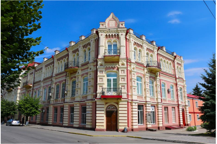
Main building of Pavlo Tychyna Uman State Pedagogical University